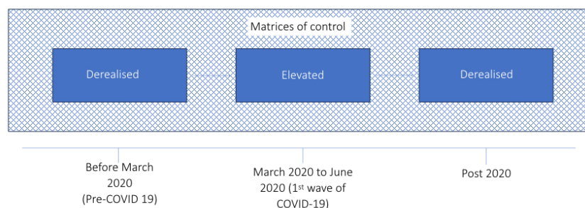
Figure 2: Broad typology of nurses' trajectories through the signifying economy of hero discourses in the COVID-19 pandemic in the UK.